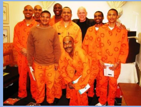
Some of the "Prisoner-Evangelists" at Pollsmoor Prison!

I was glad to be back at Pollsmoor Prison again. Last time it was to train "prisoner-pastors" who could follow up on the growing number of men who are coming to faith in the prison. This time it was to train "prisoner-evangelists" who wanted to be trained in sharing their faith with the other prisoners. What a privilege to teach a group of hungry guys like this...who risk their lives every day to share the Gospel in the notorious Pollsmoor Prison!