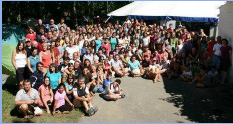
The incredible 200 young people of OJ3!