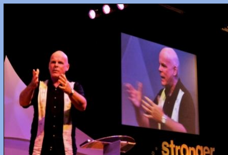
Teaching & Evangelism at Life Church in Cape Town

people recommitted to fully follow Christ.