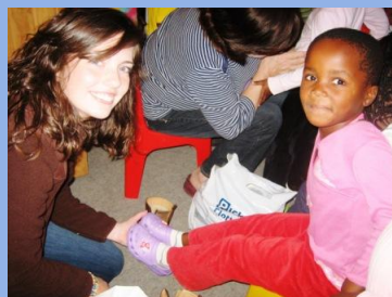
A new pair of shoes.