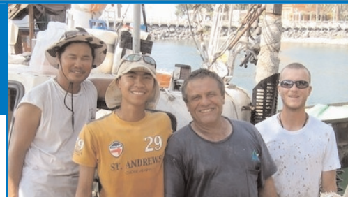
The crew from Ein Gev after a good day fishing.